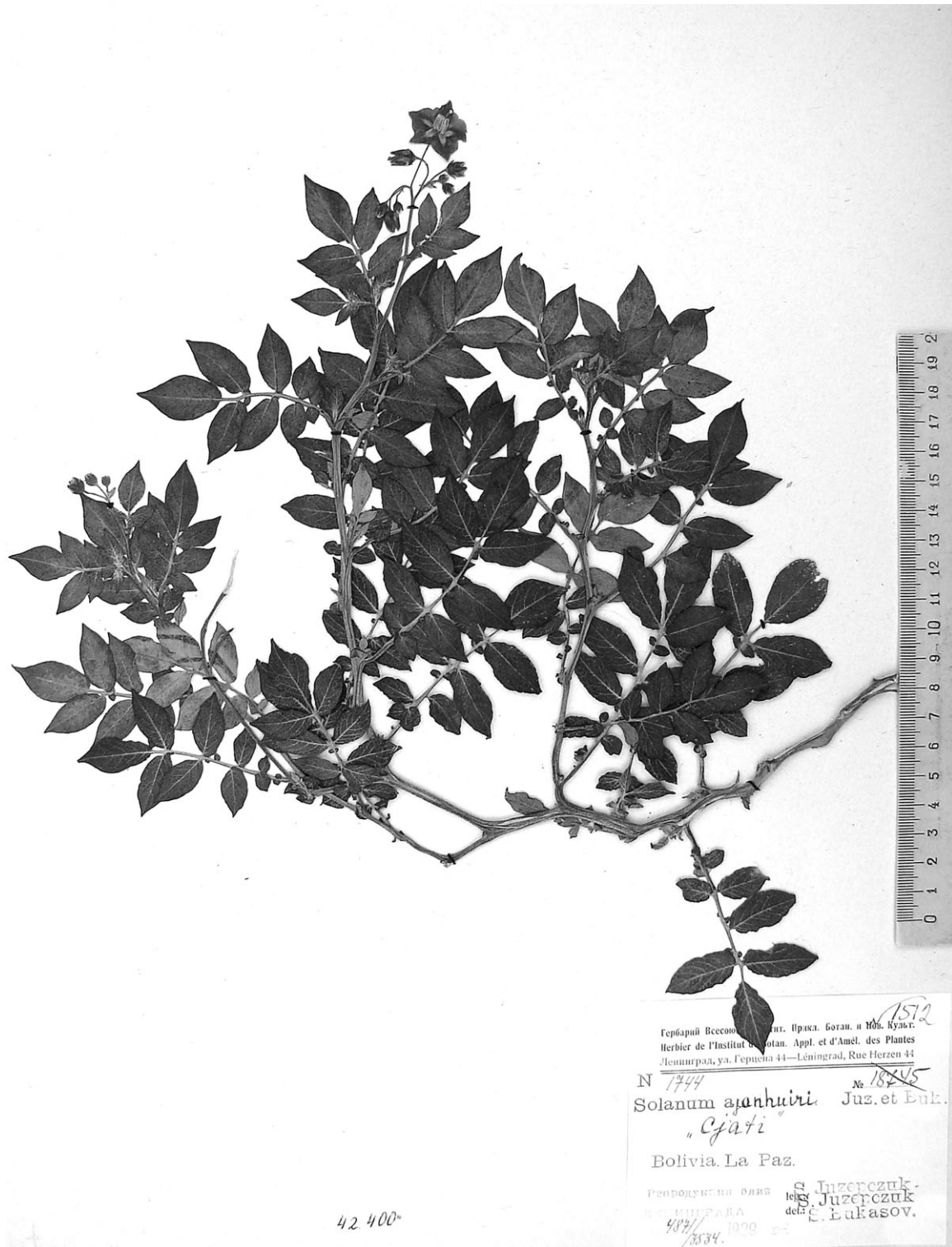
Figure 1. Lectotype specimen of Solanum ajanhuiri Juz. & Bukasov held in WIR (note spelling of specific epithet on this sheet, see text).