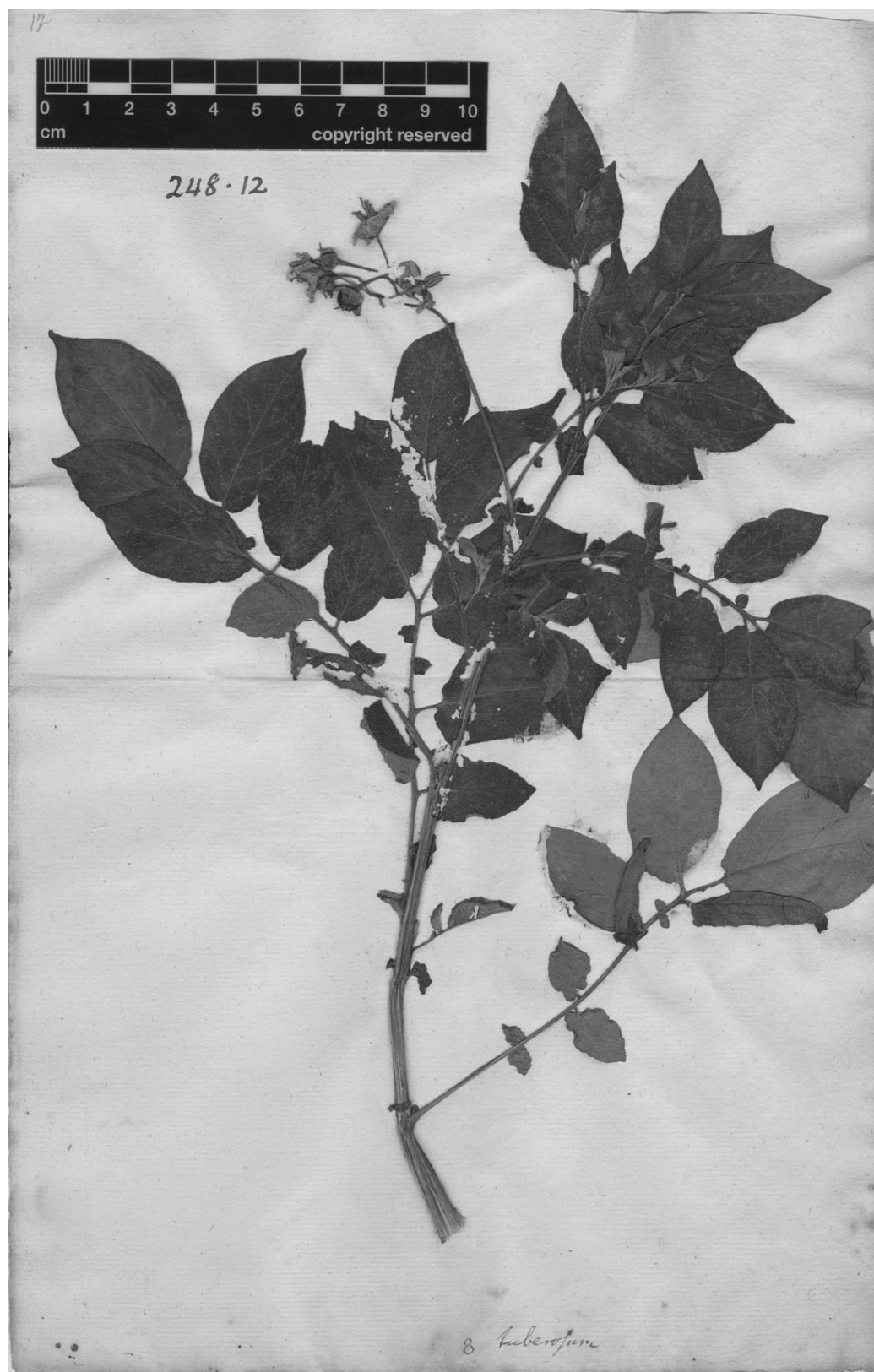
Figure 4. Lectotype specimen of Solanum tuberosum L. ( Chilotanum group) held in LINN (LINN 248.12). Reproduced with permission of the Linnean Society of London.