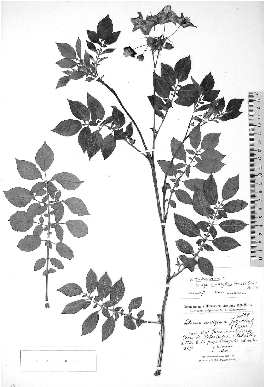
Figure 5. Lectotype specimen of Solanum andigenum Juz. & Bukasov ( Solanum tuberosum L. Andigenum group) held in LE.