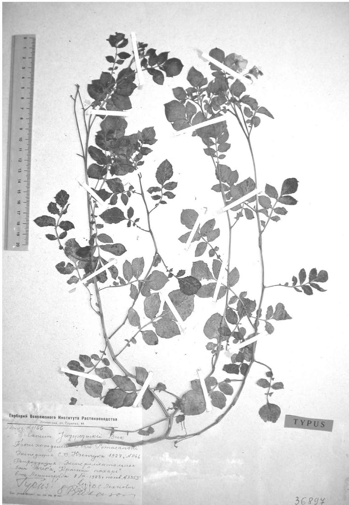
Figure 3. Lectotype specimen of Solanum juzepczukii Bukasov held in WIR (WIR-36897).