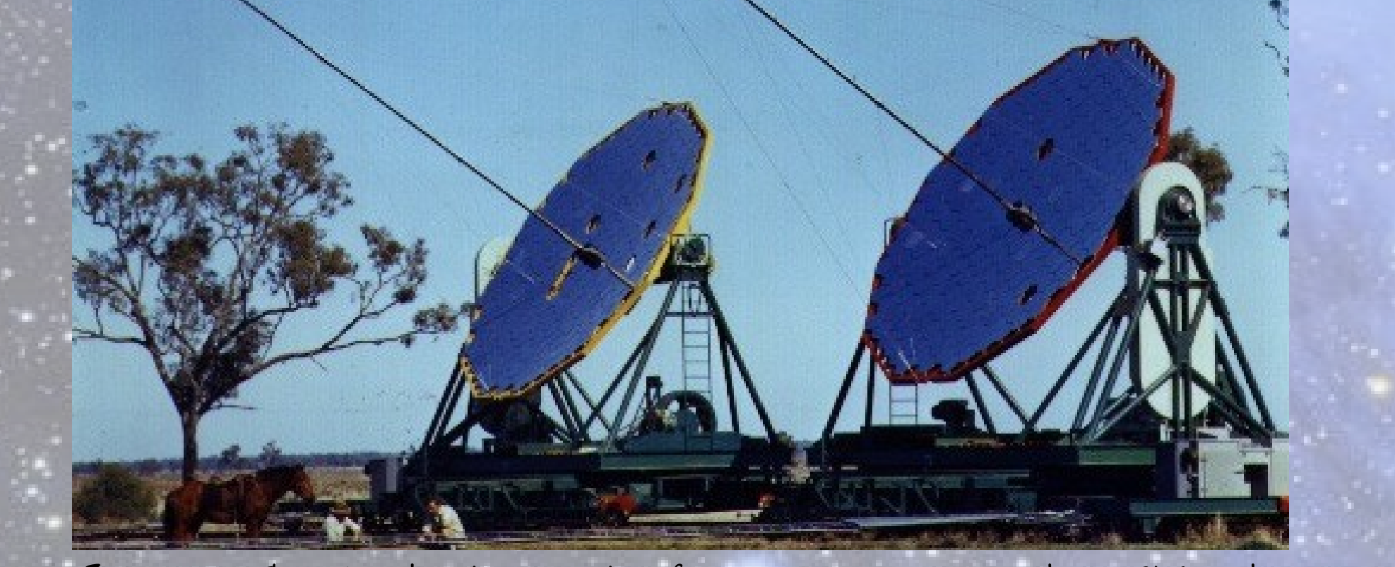
Figure 8: The Narrabri Intensity Interferometer was constructed in 1965 and operated until 1971. Each telescope was 6m in diameter, twice as large as the StarBase telescopes.

Stars exist in a broad range of varieties with different features that have been predicted but never directly observed. Large arrays of telescopes with Intensity Interferometry capability could achieve this breakthrough and reveal hot and cool