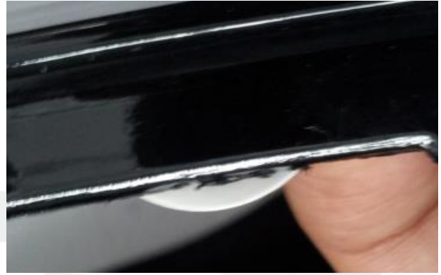
✗ Figure 5 (Incorrect)

6. Once the adhesive has set, reinstall the fascia.