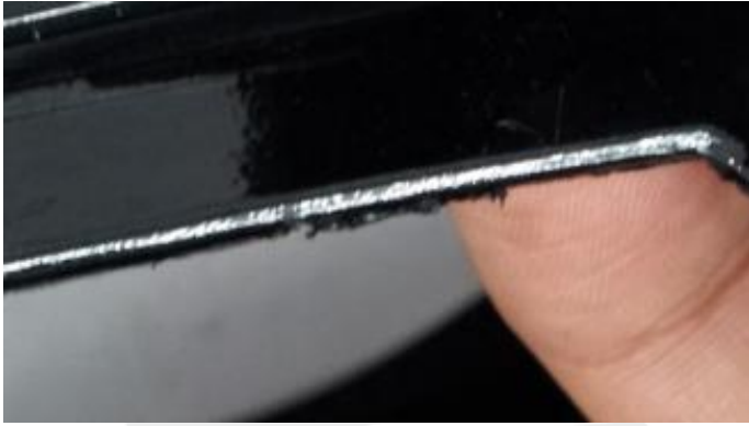
✓ Figure 4 (Correct)

NOTE: The shims must not protrude from the flange (Figures 4 and 5). If any shim protrudes, the fascia is prevented from sitting flush with the quarter panel.