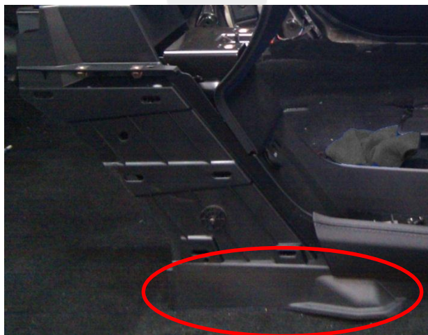
Figure 1 (Shown with seat removed for clarity)

NOTE: The change to the console carrier is minor and minimally noticeable (Figure 1). The console carrier should only be replaced upon specific customer complaint.