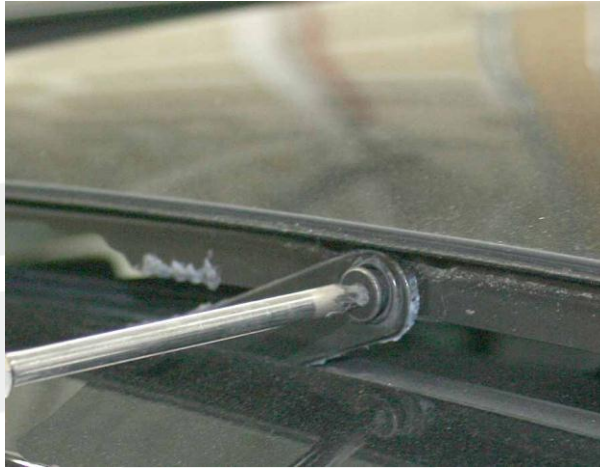
Figure 1 (Rear LH bolt shown)