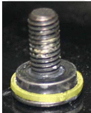
Figure 2 (Washer highlighted)