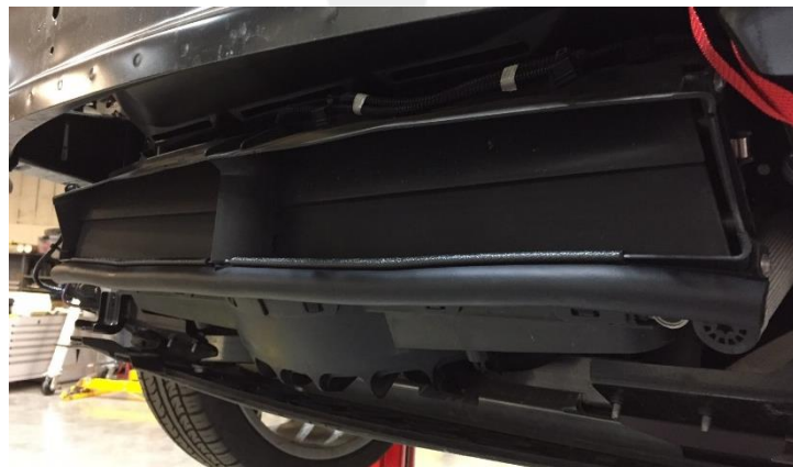
Figure 2 (Seal installed)