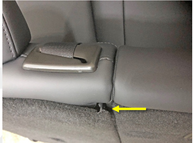
✘ Figure 2 – Example of excessive gap between LH seat back panel and seat