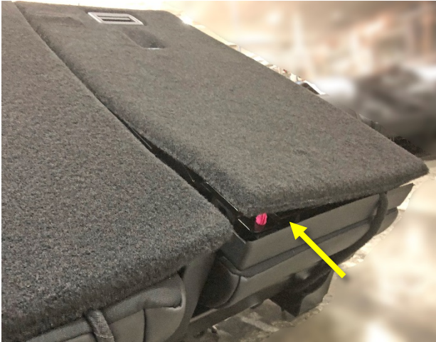
✘ Figure 1 – Example of excessive gap between center seat back panel and seat