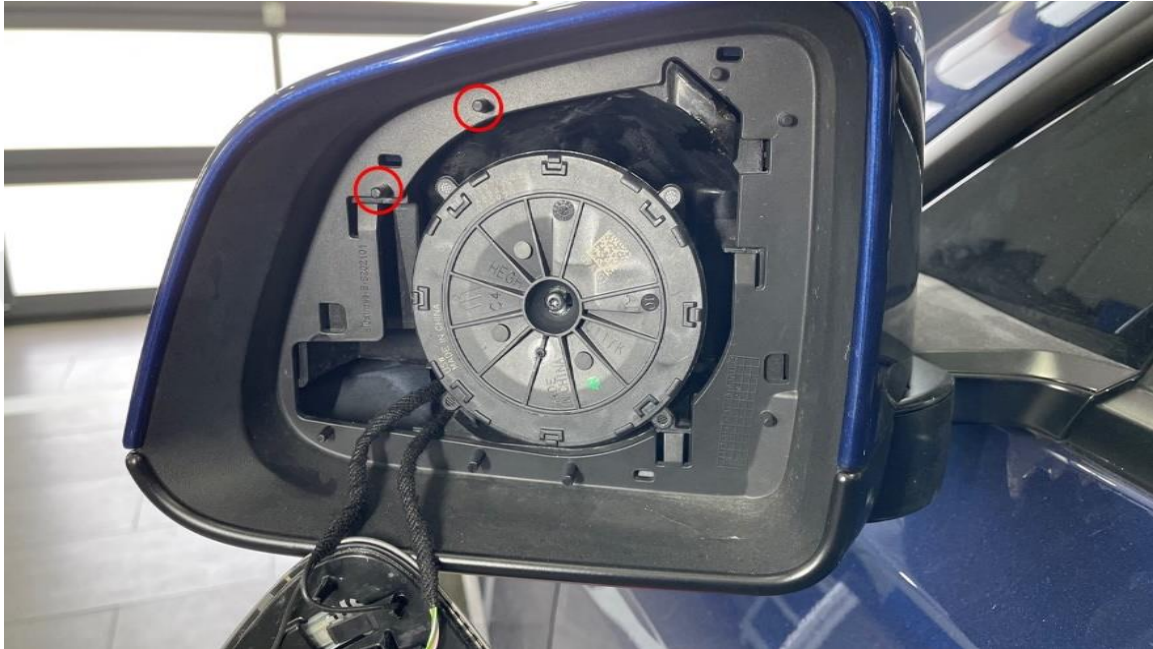
Figure 1 – Standoffs shown

⚠ WARNING: To reduce the risk of personal injury, use cut resistant gloves and appropriate eye protection while performing this step.