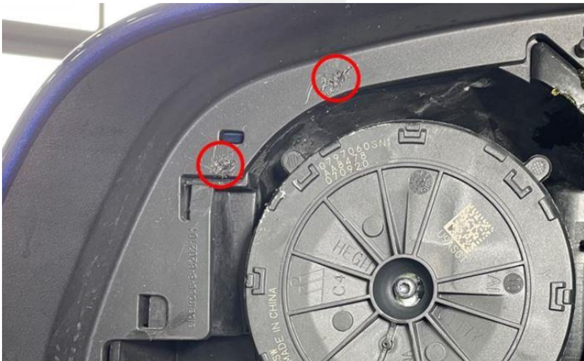
Figure 2 – Standoffs removed