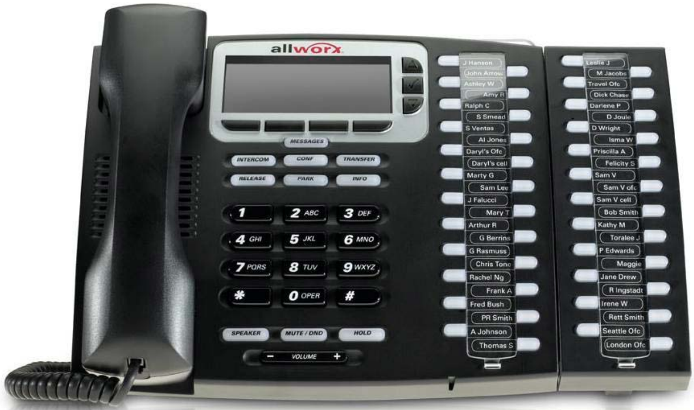
Tx 92/24 Telephone Expander connected to the 9224 Phone

A power supply is not included. The connected phone provides power to the telephone expander.