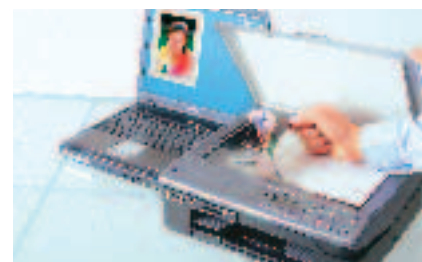
Scanning at up to 19,200dpi interpolated resolution