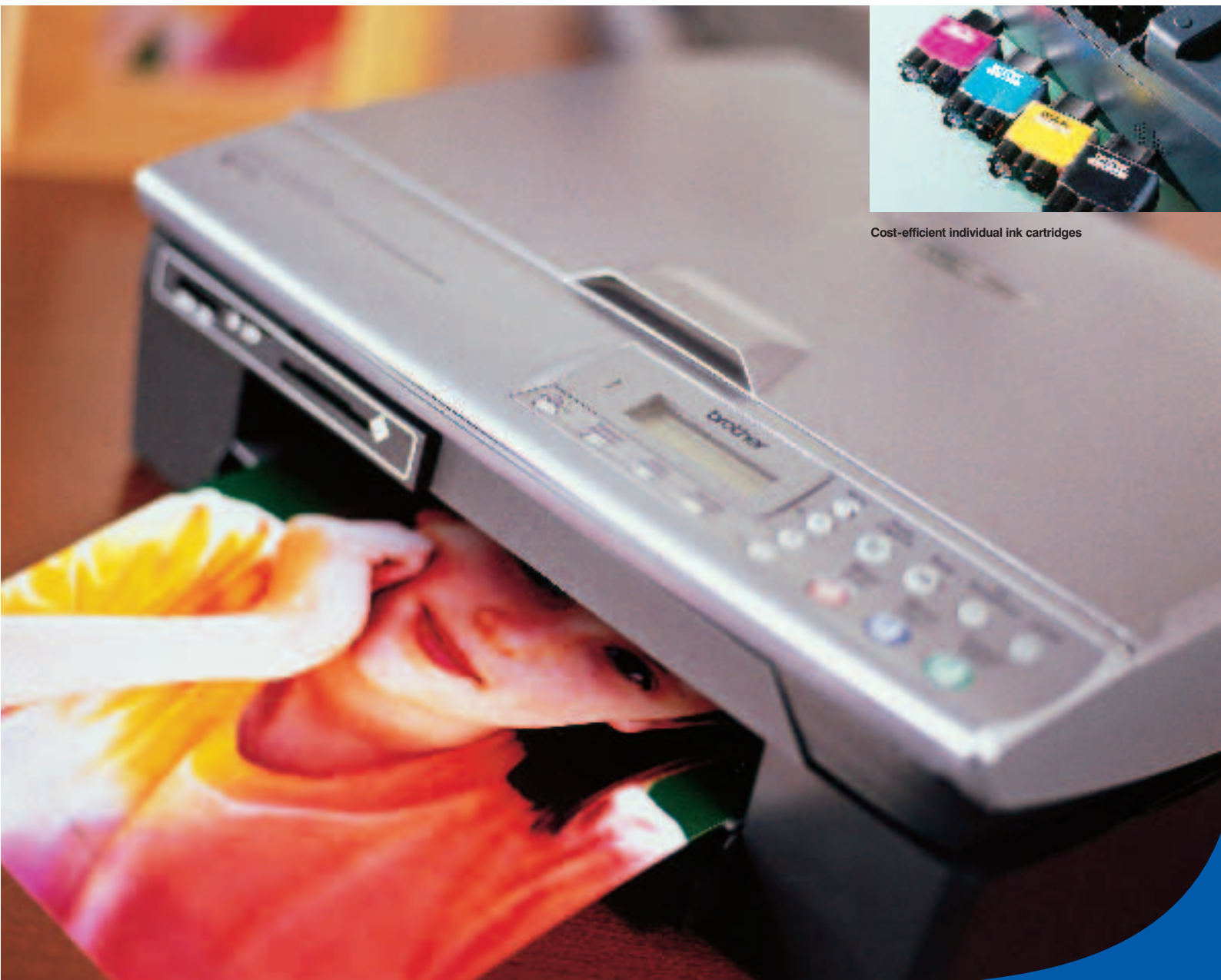
Cost-efficient individual ink cartridges

Eliminating the frustration of having to throw away unused inks, Brother's colour inkjet machines provide separate ink cartridges for each colour. Now all you have to do is replace the empty colour cartridge reducing wastage and the cost per copy.