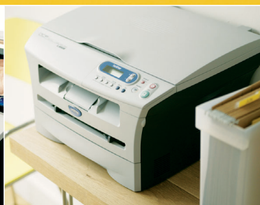
Stylish and compact