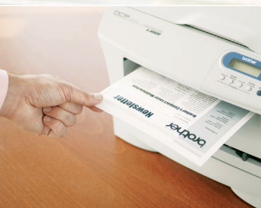
Up to 20ppm print speed