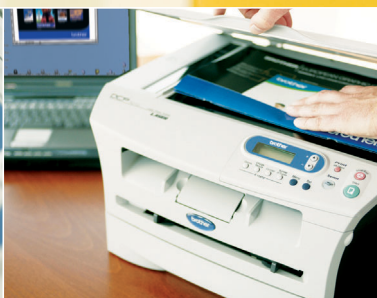
Colour scan bound documents