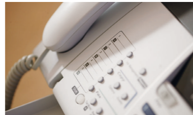
Integrated telephone handset No need to invest in a separate handset