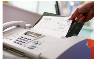
Up to 20 page automatic document feeder Fax and copy multi-page documents quickly and easily