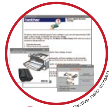
Interactive help screen

Practical and user-friendly, it handles a wide range of paper types and sizes with ease, and features a built-in 'on-screen Interactive Help' function, serving as a 24 hour help desk. It's this combination of economy and performance that makes the HL-1030 an ideal printer for any user looking for a cost-effective solution.