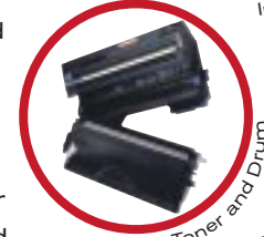
Toner and Drum