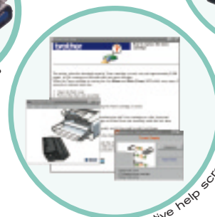
Interactive help screen