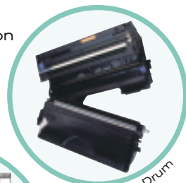
Toner & Drum