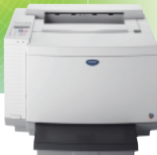
A3 Colour Laser Printer

Brother's new HL-3450 and HL-2600 colour laser printers bring high quality printing, efficiency and affordability which is so important in today's business world. These latest models have been developed in response to the increasing demand for cost effective, high performance colour printers in the workplace.