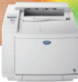
A4 Colour Laser Printer