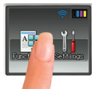
1.8" Touchscreen (HL-L9200CDW)

Both models offer a color Touchscreen display for easy menu navigation and to access the Web Connect feature. Plus, with the MFC-L9550CDW, you can create and access up to 48 time-saving shortcuts for your most commonly-used functions and operations directly from the Touchscreen display.