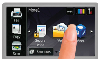
4.85" Touchscreen (MFC-L9550CDW)