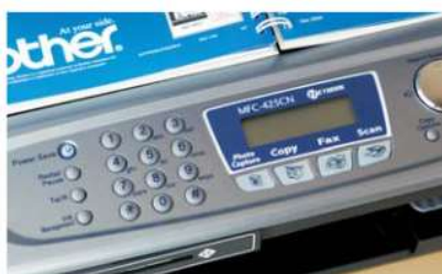
80 Speed dials and a 400 page fax memory**