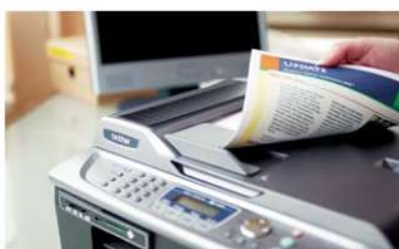
10 page Automatic Document Feeder