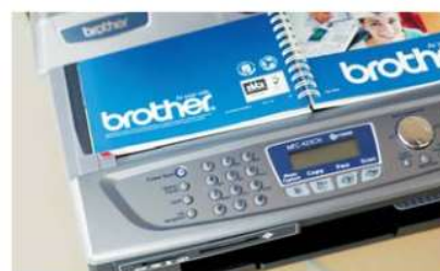
Flatbed Scanning at up to 19,200dpi interpolated resolution