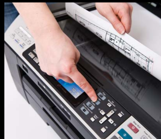
Fax, copy or scan your A3 documents.