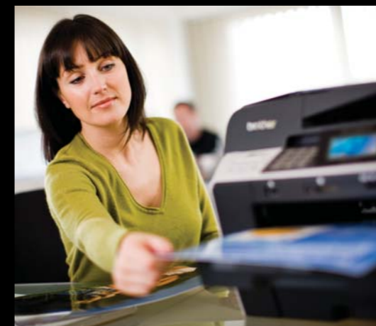
Create an impact - with colour printing up to A3