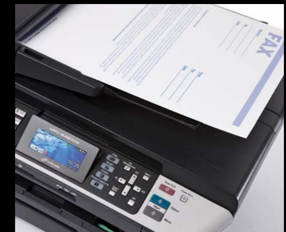
Automatic Document Feeder - ideal when faxing, copying or scanning multiple page documents.