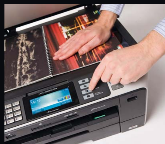
Fax, copy or scan your A3 documents.

Get cost-cutting performance with the compact, versatile MFC-6890CDW offering up to A3 printing, faxing, copying and scanning, high yield ink cartridges, and automatic A4 duplex.