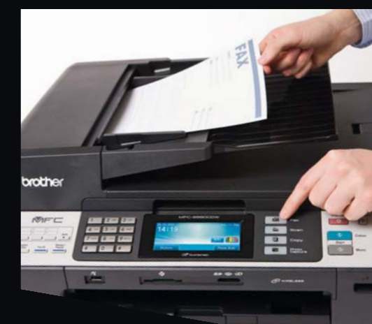
Automatic Document Feeder – ideal when faxing, copying or scanning multiple page documents.