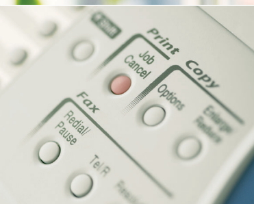
Outstanding print performance