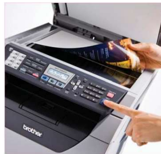
Scan your A4 colour documents.

Get first-rate quality office documents and low running costs with the compact, fast and user-friendly Brother MFC-8380DN.