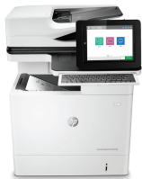
HP LaserJet Managed Flow MFP E62565h