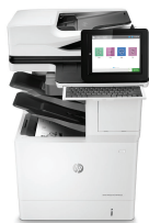
HP LaserJet Managed MFP E62565z