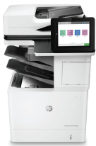
HP LaserJet Managed MFP E62565hs

This HP LaserJet MFP with JetIntelligence combines exceptional performance and energy efficiency with professional-quality documents right when you need them—all while protecting your network from attacks with the industry's deepest security. 1