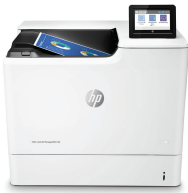
HP Color LaserJet Managed E65150dn

Dynamic security enabled printer. Only intended to be used with cartridges using an HP original chip. Cartridges using a non-HP chip may not work, and those that work today may not work in the future. http://www.hp.com/go/learnaboutsupplies