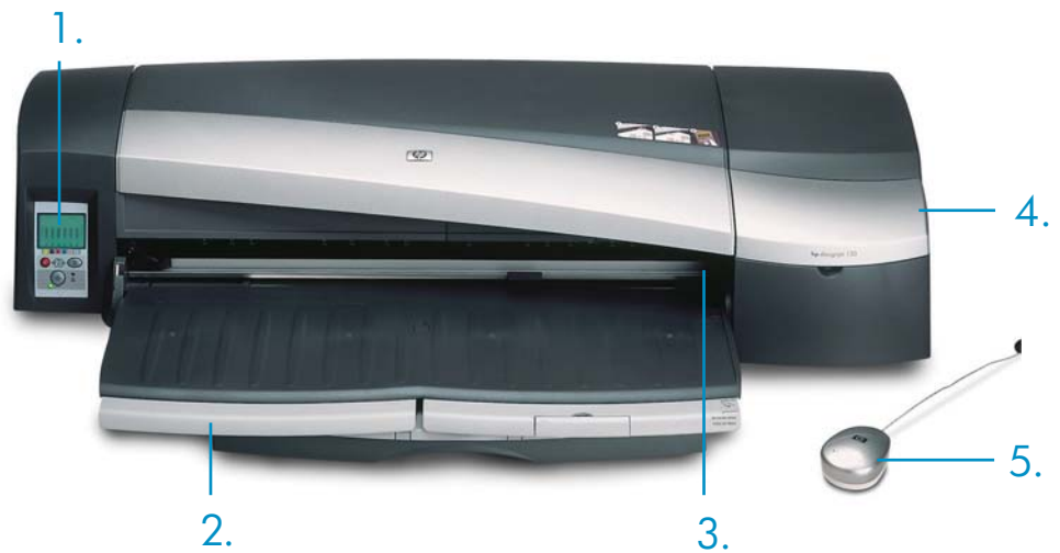
HP Designjet 130gp front shown

Modular ink system with six independently replaceable ink cartridges allows you to replace only the ink colors you need