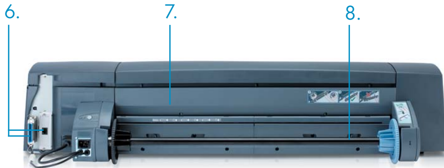
HP Designjet 130nr rear shown