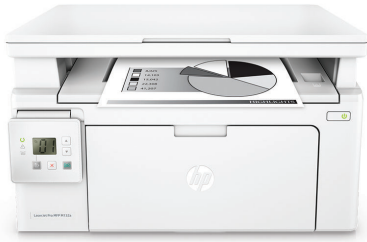
HP LaserJet Pro MFP M132a

Print professional documents from a range of mobile devices, 1 plus scan, copy, fax, and help save energy with a wireless MFP designed for efficiency.