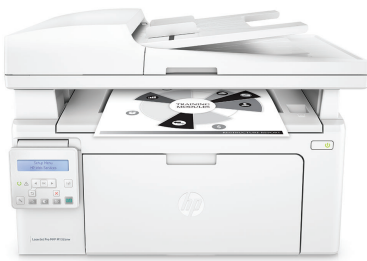
HP LaserJet Pro MFP M132snw