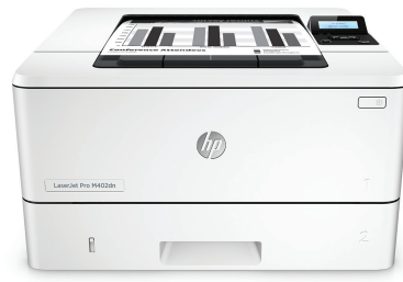
HP LaserJet Pro M402dn

Printing performance and robust security built for how you work. This capable printer finishes jobs faster and delivers comprehensive security to guard against threats. 1 Original HP Toner cartridges with JetIntelligence give you more pages. 2