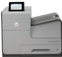
HP Officejet Enterprise Color X555dn

A printing revolution for your enterprise. Produce color documents at up to twice the speed and half the cost per page of color lasers. 1,2 Designed with advanced security and full manageability, this enterprise printer is built to last.