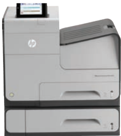
HP Officejet Enterprise Color X555xh