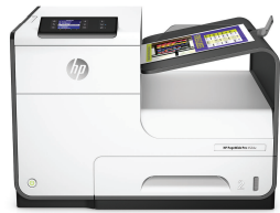
HP PageWide Pro 452dw Printer