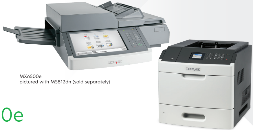
MX6500e pictured with MS812dn (sold separately)