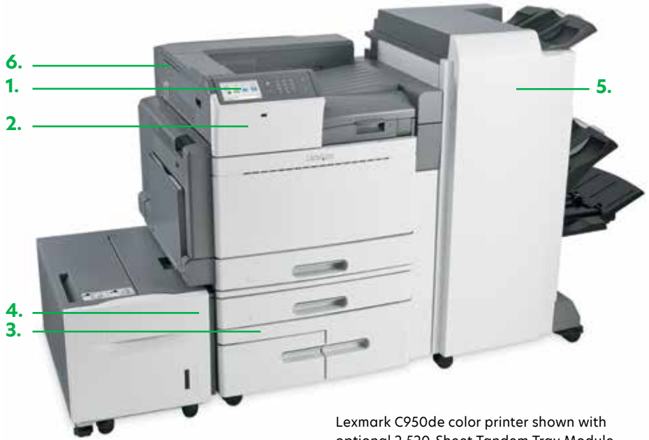
Lexmark C950de color printer shown with optional 2,520-Sheet Tandem Tray Module, Booklet Finisher and 2,000-Sheet High Capacity Feeder.

Reduce unnecessary printing and simplify work processes through solutions applications preloaded on your device. Choose additional Lexmark solutions to fit your unique workflow needs.