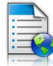
Forms and Favorites