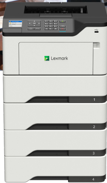
B2650dw with optional trays