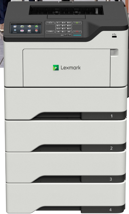
MS622de with optional trays