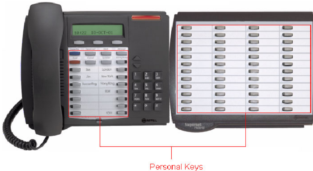
Figure 3, 5020 IP Phone with 5415 PKM attached

The following illustration shows the personal keys available on your Mitel Networks 5020 IP Phone, and when attached to a Mitel Networks 5415 PKM.