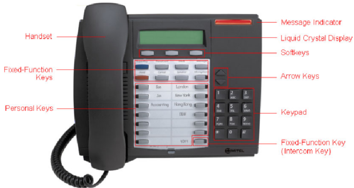
Figure 1, Mitel Networks 5020 IP Phone

The Mitel Networks 5020 IP Phone features dual ports which allows your telephone to be attached to a PC as well as the telephone network, an easy-to-read display, a Message Waiting Indicator, three softkeys, nine fixed-function keys, thirteen personal keys and two arrow keys ( ▲ and ▼ ).