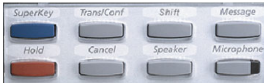
Figure 2, Fixed Function Keys on your 5020 IP Phone

Each personal key may be programmed with: