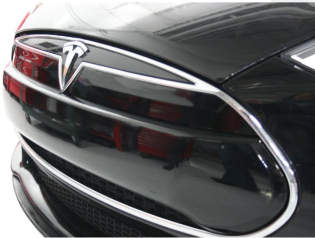
Figure 1 (1 st generation)

Early Model S vehicles were equipped with the 1 st generation front fascia applique (nosecone) that had a horizontal ridge across the front (Figure 1). This style of nosecone is no longer in production and must be replaced with the smooth, 2 nd generation nosecone (Figure 2) after a front collision or if the applique needs to be replaced for another reason.