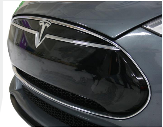
Figure 2 (2 nd generation)