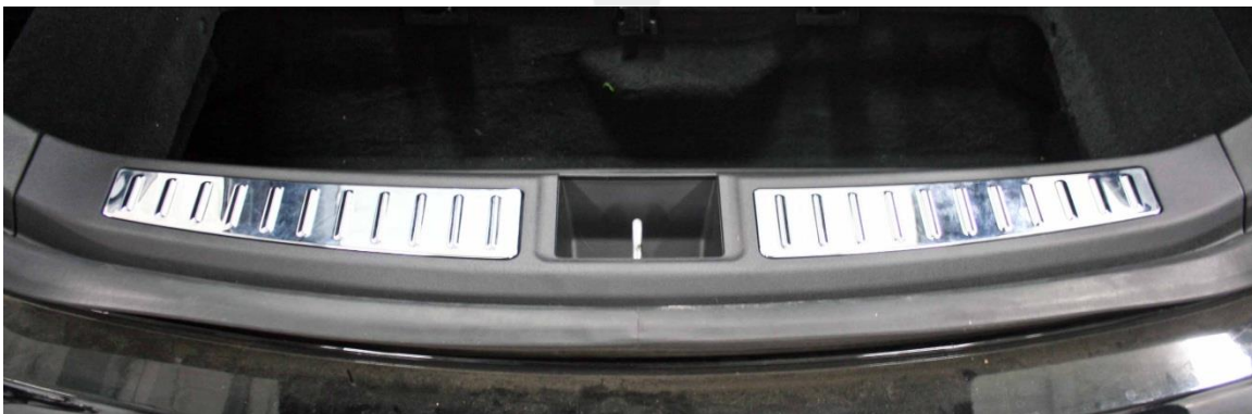
Figure 2 (Trunk sill)