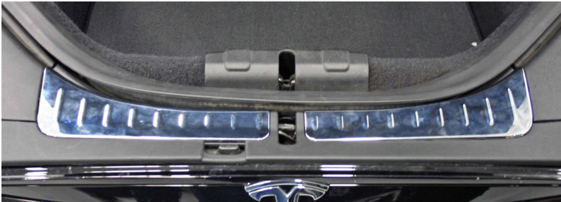
Figure 1 (Front underhood apron)

A set of chrome inserts for the front underhood apron and rear trunk sill (Figures 1 and 2) are now available as accessories for customer purchase. The kits include customer-facing installation instructions CD-13-10-001. However, if a customer is unable or unwilling to install the inserts themselves, service centers should use this service bulletin to install them.