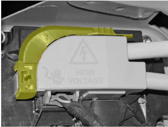
Figure 1 (Locking piece highlighted)