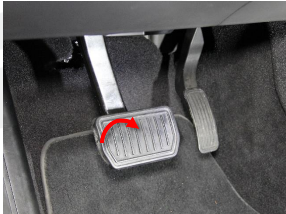
Figure 1 (LHD shown, RHD similar)