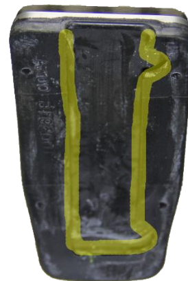
Figure 3 (Groove on accelerator pedal pads highlighted)