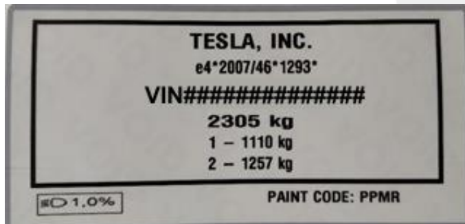
Figure 2 (EU label)