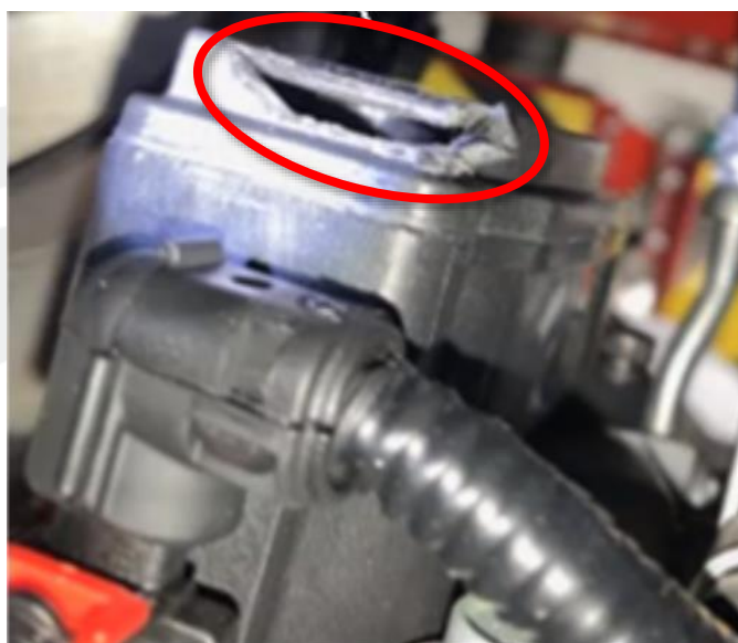
✘ Figure 1 – Damage to the EPB case housing