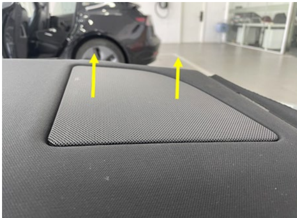
Figure 3 – LH Parcel Shelf Speaker Grille