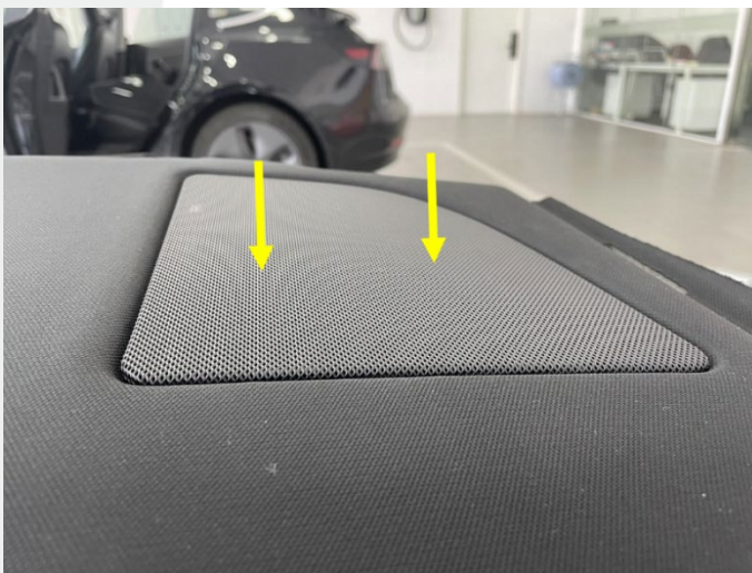
Figure 6- LH Parcel Shelf Speaker Grille