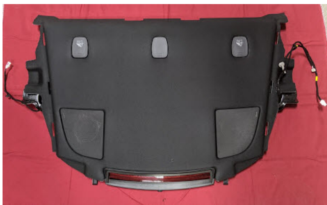
Figure 1 – Package Tray Trim

Inspect the speaker grilles on the package tray trim and headliner. (Figures 1 and 2).