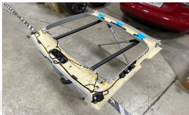
Figure 2 – Headliner