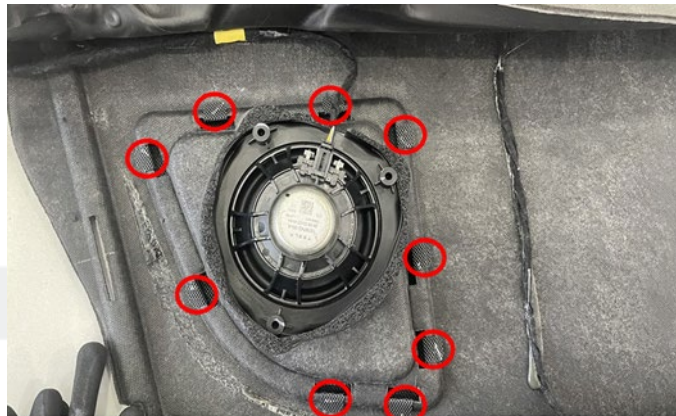
Figure 4 – LH Parcel Shelf Speaker Grille (Inside)