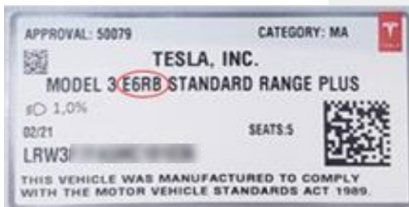
Figure 2 – Standard Range Vehicle