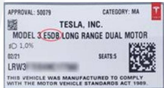
Figure 3 – Long Range Vehicle