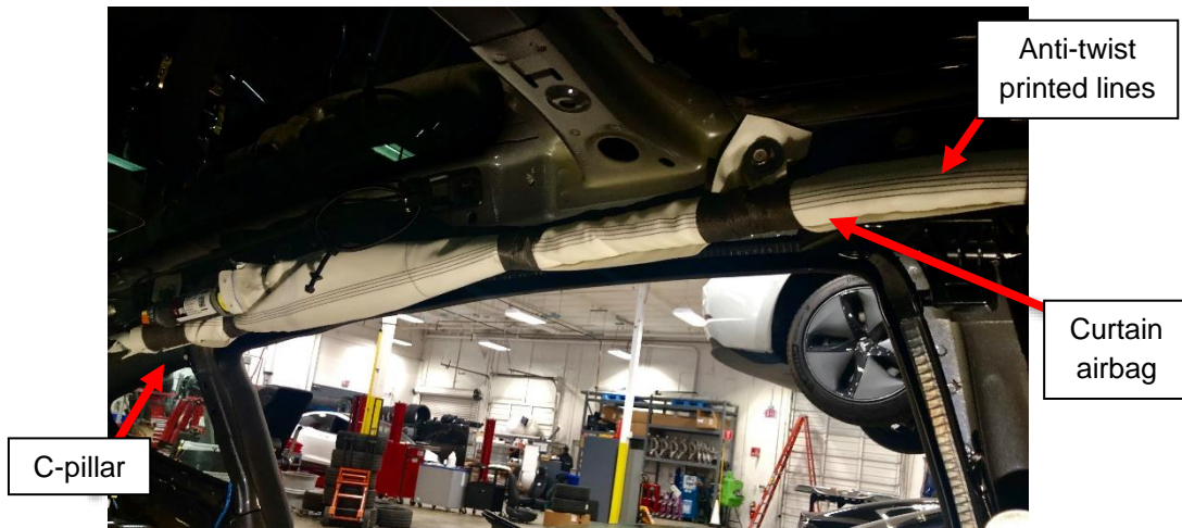
✓ Figure 3 – LH curtain airbag, rear view; RH similar