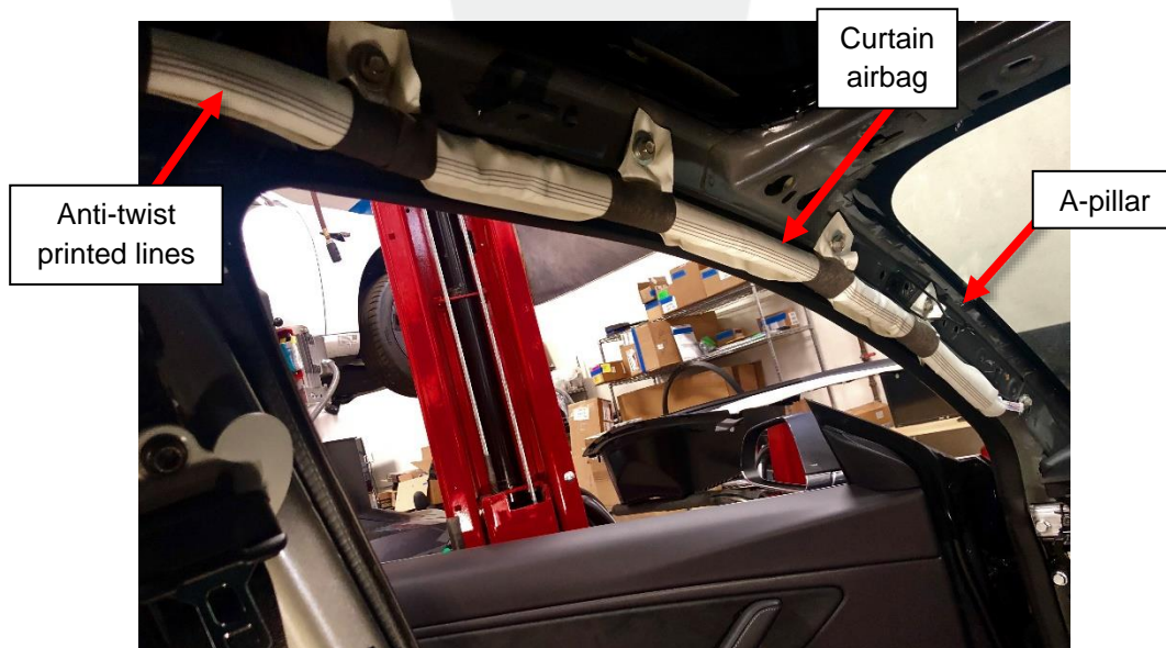
✓ Figure 2 – LH curtain airbag, front view; RH similar