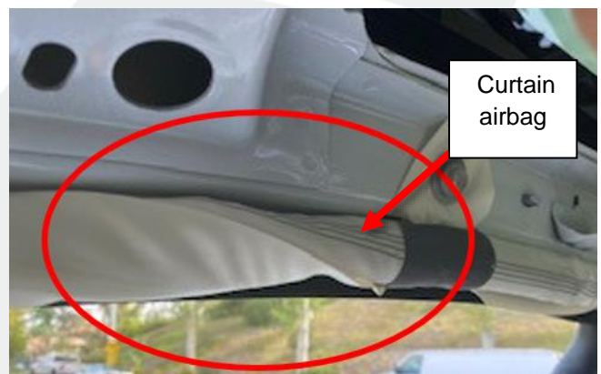
✗ Figure 5 – Twisted curtain airbag; LH shown, RH similar