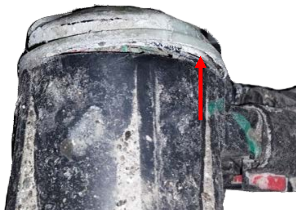
Figure 3 (Dislodged cap)