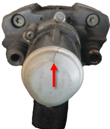
Figure 2 (Cracked cap)

Undetected caliper damage can lead to water ingress, intermittent electrical connections, and electronic parking brake faults (Figures 2 and 3).