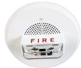
Series E-90 + LS