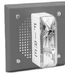
Series E-70 + LS