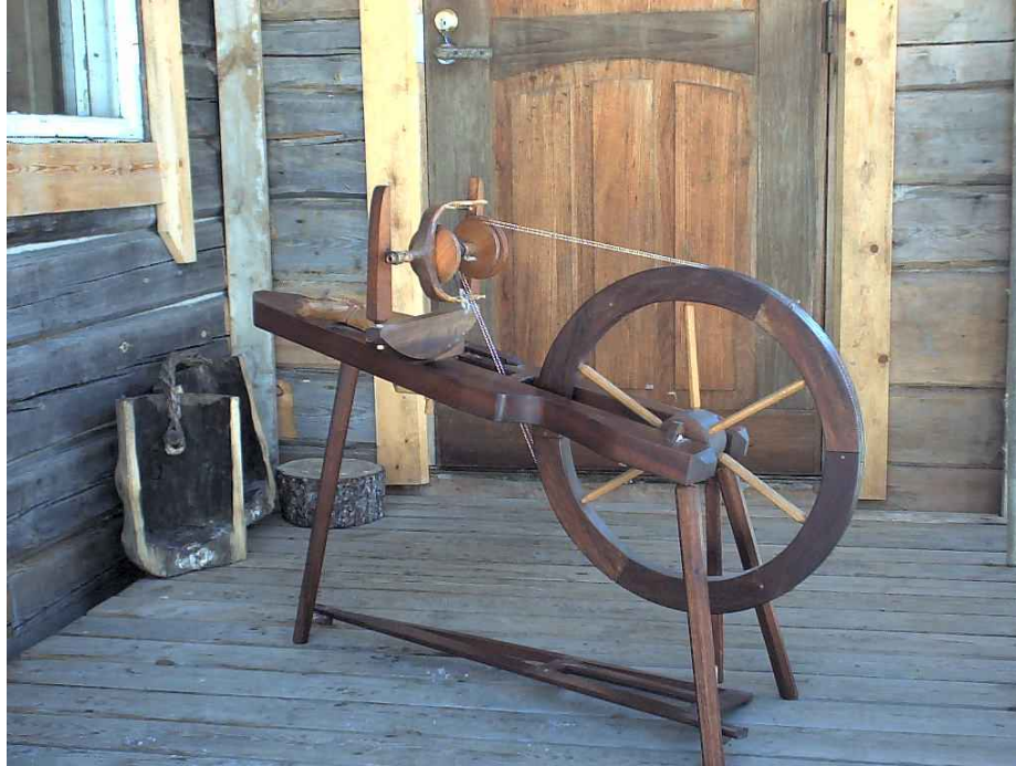
A spinning-wheel does not need any metal parts