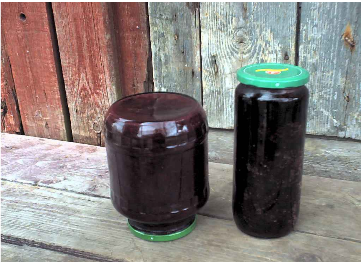
Berries preserved by turning the jars

Before the Winter War, the Finnish government published a booklet wherein they urged people to prepare for hard winter and increase the supplies of food from nature. As a help for preserving, sugar, plus other preserving chemicals were mentioned, but these were also scarce during the war. If there was information about preserving berries without sugar, it would have probably been mentioned in the booklet. How can this kind of information vanish? Maybe because most of the old preserving guides that I have seen, have been published by the sugar industry.