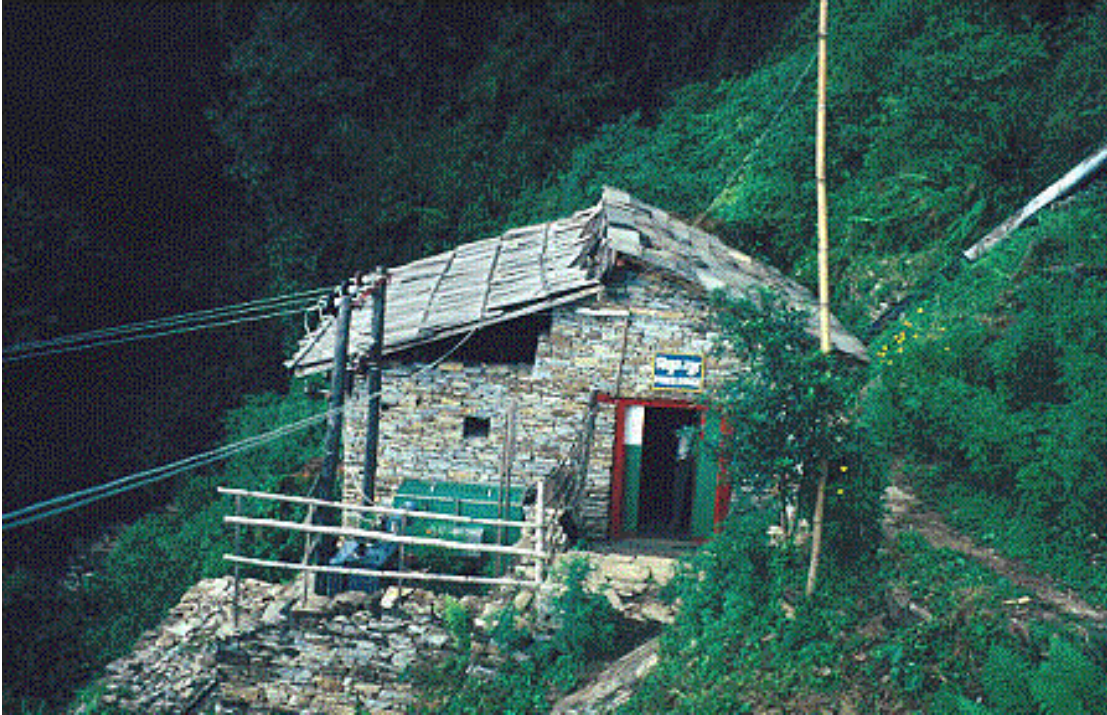
Figure 2: Micro hydro scheme showing the power house, the penstock and the transmission lines

possible where river flow fluctuates throughout the year or where daily load patterns vary considerably.