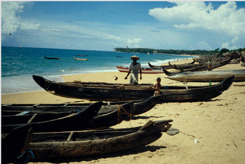
Figure 2: Traditional boats in South India

This is the main craft type of South Kerala and the Kanyakumari District of Tamil Nadu, where the South West Monsoon surf conditions are the most severe. Literally a tied-log raft (in the Tamil Language Marram means log, and Katu means tied). It is constructed of light-weight timber logs (Albizia or Kapok) which are shaped and lashed together to form a very sea-worthy craft.