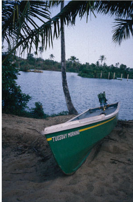
Figure 1: Ply vallum boat (stitch and glue), South India