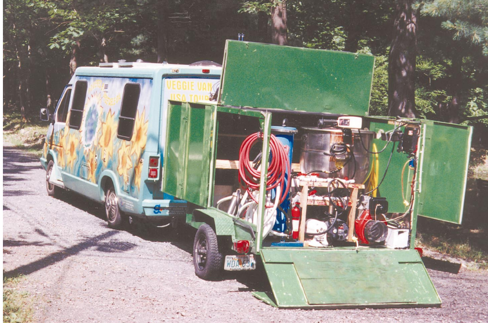
Above: The Veggie Van with the Green Grease Machine in tow.

Enamored with the idea of transforming the fast food restaurant fryers of America into a network of low-cost gas stations, we decided to build a portable fuel processor, buy a motor home with a diesel engine, and travel across the country. Sitting on a local used car lot was a 1986 Winnebago LeSharo with a 2.1 liter Renault diesel engine that would soon become the "Veggie Van." The small, white van had the perfect engine and it got 25 miles to the gallon. Two purple, gleaming photovoltaic panels soon adorned its roof line. The panels allowed us to stay "off the grid" because they powered the van's refrigerator, lights, computer, power