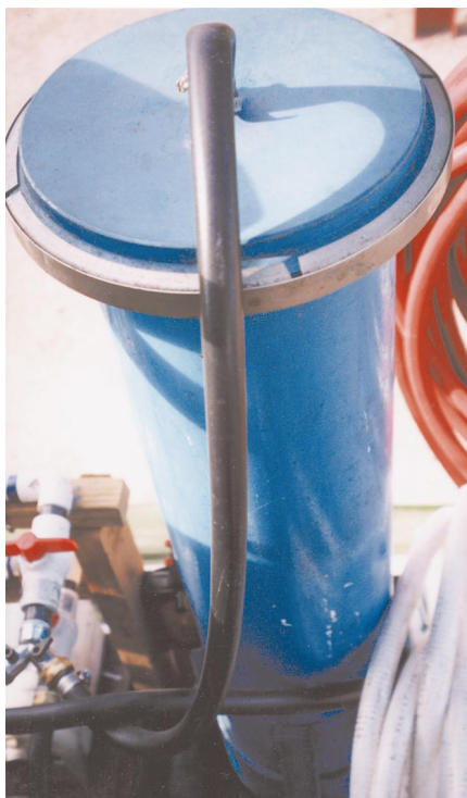
Left: A fuel filter, salvaged from a tug boat, gets the bits of french fries out of the cooking oil.

actually worked! For months, we experimented with various blends of vegetable oil as fuel, succeeding to run our VW Jetta on up to 80% straight fryer grease for over 5,000 miles.