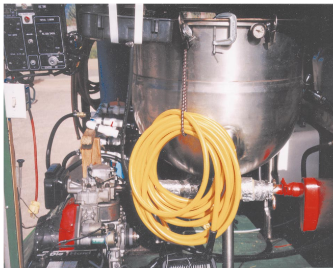
Also shown, the Yanmar Diesel generator which runs on biodiesel to power the Green Grease Machine.