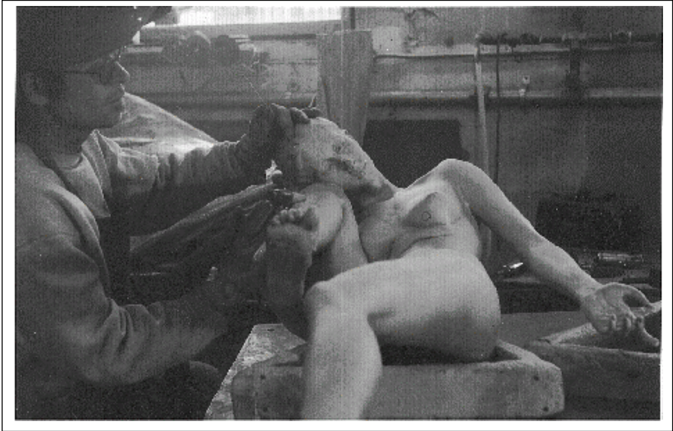
Picture 3. Here the work begins. It is know as de-vesting the casting, sandblasting, cutting sprueing off the sculpture with a body grinder, reciprocating saw, or plasma cutter. You will inspect the metal for flaws in the metal, which have to be repaired, and do a lot of precise welding. I'm using a heli arc or TIG welder to join the pieces of a full body lifecasting.

applied directly to the object to be molded. This is not the mold that the molten metal will be poured into. This is the mold from which you make the wax duplicate that will be used as the pattern for the final casting in metal.